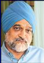
Montek Singh Ahluwalia Planning Commission Deputy Chairman